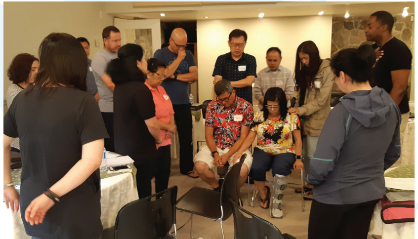
Praying for CMCA leaders