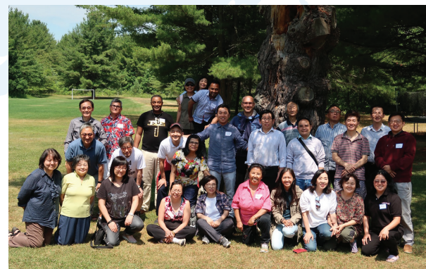
2019 CMCA Leaders' Retreat