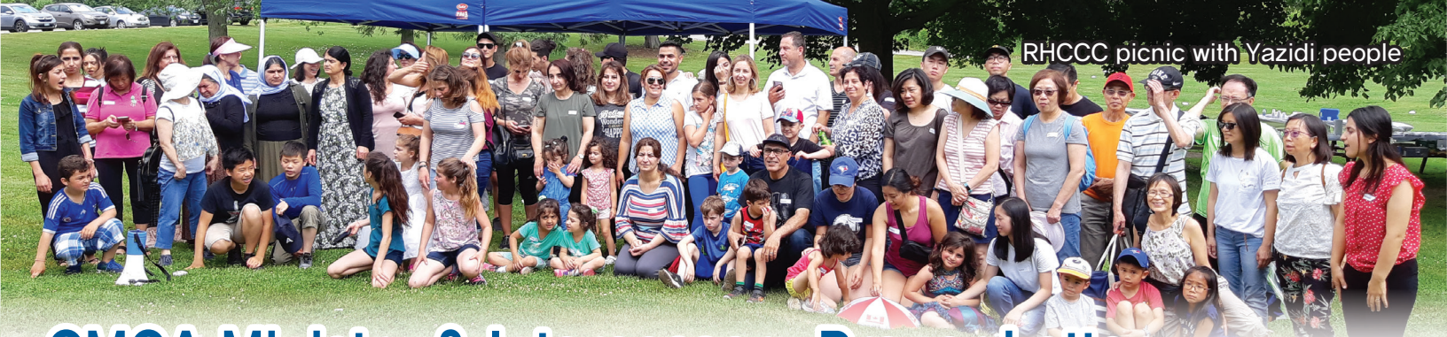
RHCCC picnic with Yazidi people